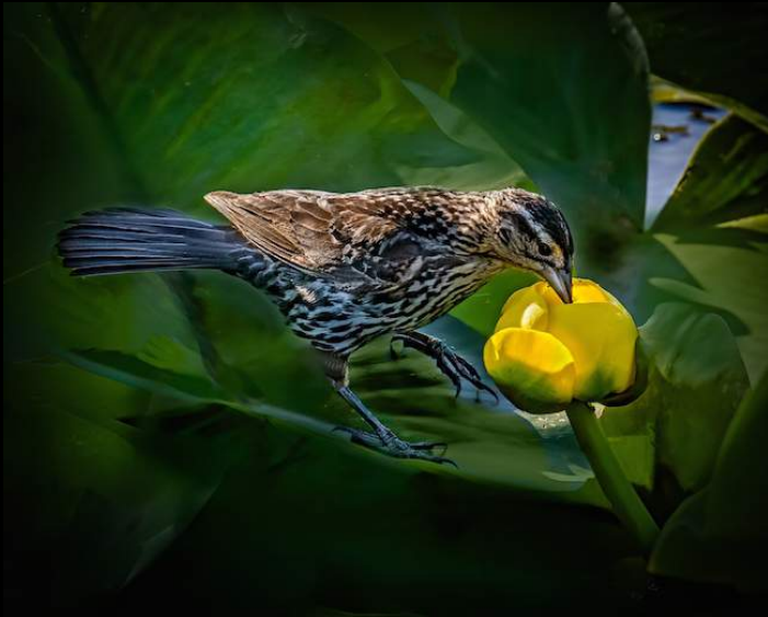
Norm Rheaume Black Bird On Lilly Pad HM Beginner EOY NA