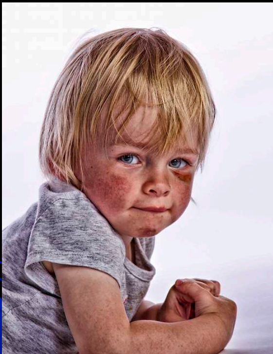
Les Menard Play Hard, Play Dirty HM Salon EOY CG