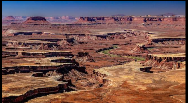
Alan Defoe Canyonlands & Green River HM Beginner EOY CG