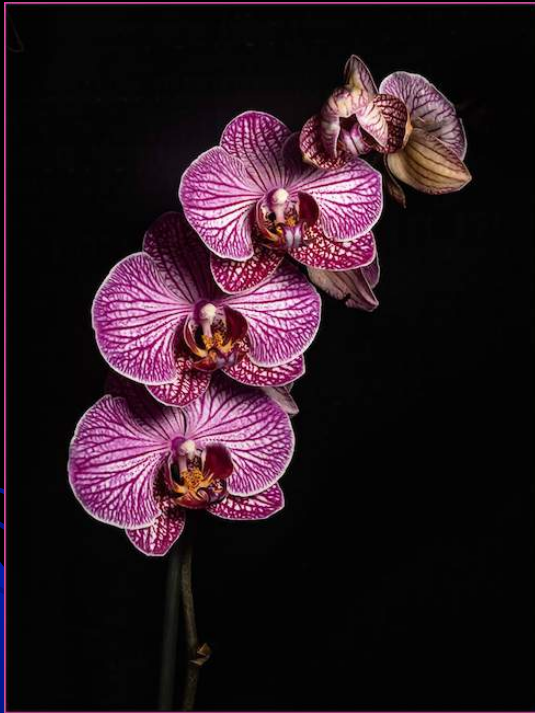
Palmer Johnson Purple Orchids HM Advanced EOY CG