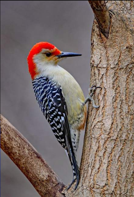
Claude Gauthier Red Headed Woodpecker 7 HM Beginner EOY NA