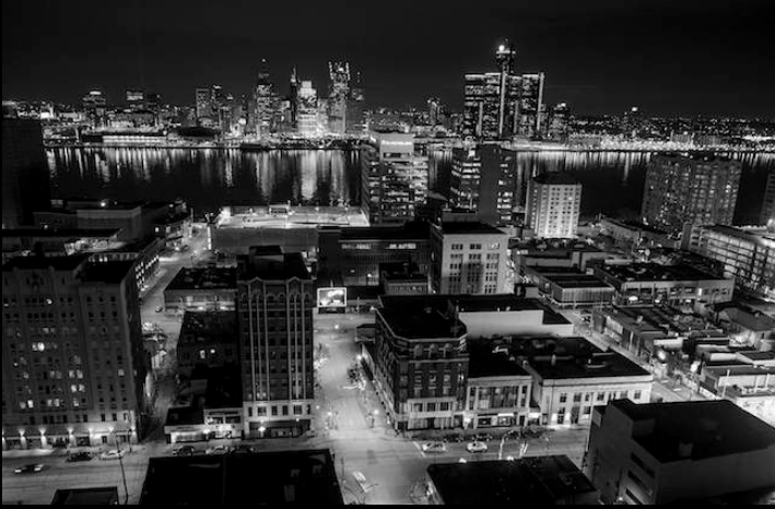
Regina Meyes Looking across the River HM Beginner EOY MG